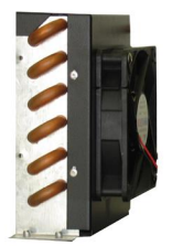
Over Sized Air Cooled Condenser