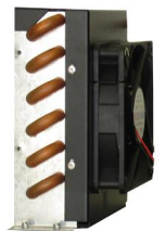
Over Sized Air Cooled Condenser